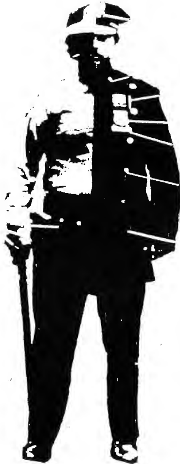
Beware of this man.